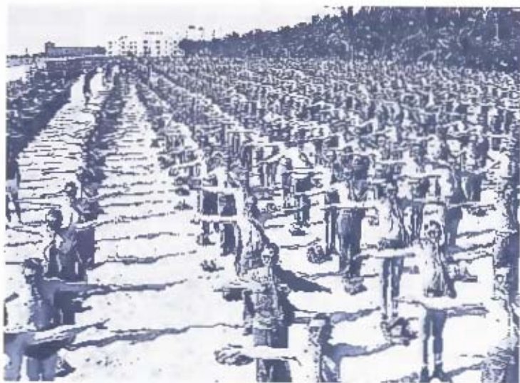
World War II training camp, Miami Beach

A significant trend of the postwar era has been steady population growth, resulting from large migrations to the state from within the U.S. and from countries throughout the